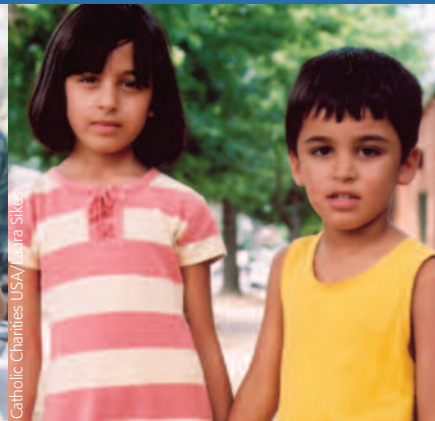
Catholic Charities USA/Laura Sikes