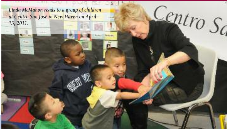
Linda McMahon reads to a group of children at Centro San José in New Haven on April 13, 2011.

MISSION: Motivated by Christ's Social Teachings and Respect for the Richness of Diversity, Catholic Charities exists to Promote the Dignity, Self-Sufficiency and Human Potential of those in need.