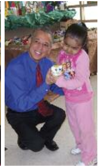
The Honorable Pedro E. Segarra, Mayor of the City of Hartford, read to the children and received a special homemade gift from one student during his visit to the Institute for the Hispanic Family, located at 45 Wadsworth Street in Hartford during the Week of The Young Child on April 14th.